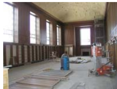
West Reading Room

Plaster cracks in the ceilings of both rooms have been repaired and painted, and sprinklers have been added for fire protection. Computer wireless access points will be installed in both rooms for patron convenience, and the original fireplaces will be activated with gas logs to create a focal point for a casual reading environment.