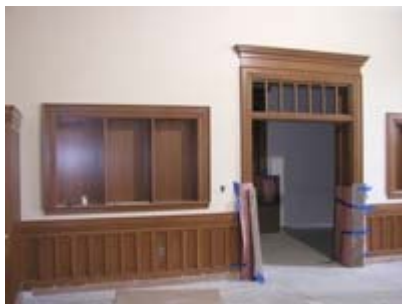
IMCPL Foundation Conference Room

The former visual arts and music sections will now be home to new offices for librarians and staff.