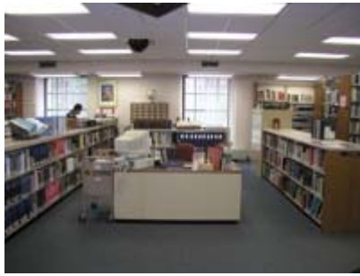
Second Floor, West Side - former