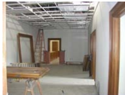
IMCPL Foundation Offices

In the area formerly known as the Cropsey Auditorium, the Indianapolis-Marion County Foundation Offices will be housed. Originally located in the Library Services Center, the Foundation is responsible for funding nearly half of the cost for the project, as well as providing funding for Library programs and staff development.