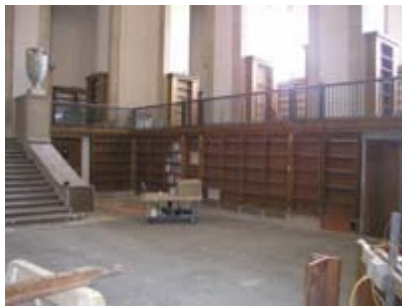
Simon Reading Room

The Simon Reading Room will exhibit the new books on display shelves, allowing the librarians to arrange covers with their faces out.