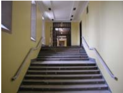
South hallway - east side.

Upon entering the south entrance to the building, the changes to the south hallway are noticeable. A new Art Exhibit display area will be located at the west end of the hallway.