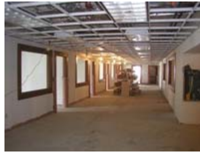
Second Floor, West Side - new