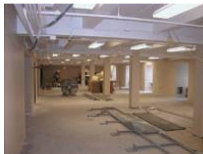
First Floor, West Side - new