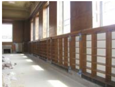
East Reading Room

In the East and West Reading Rooms, new shelving has been installed into the existing vertical framework. The exterior glass in the windows has been replaced with a highly efficient material to help reduce heating and cooling costs and to protect the books from UV damage.