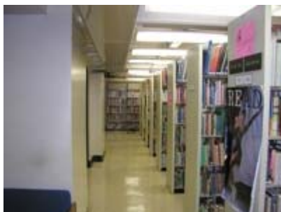
First Floor, West Side - former